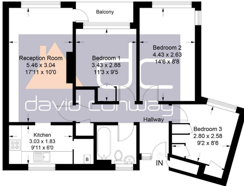
Illustration for identification purposes only, measurements are approximate, not to scale. David Conway © 2023 (ID1019501)

Approximate Gross Internal Area = 67.4 sq m / 725 sq ft